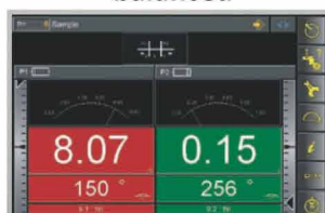
Precisely dynamically balanced