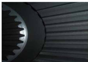
High capacity splines